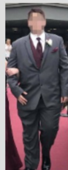
Tuxedo courtesy of Alice's Kids