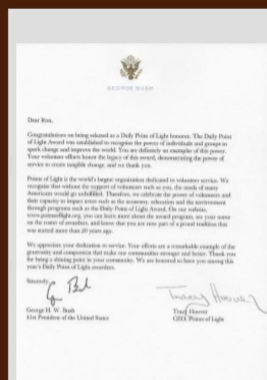
Executive Director receives Points of Light Award!