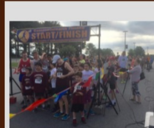
Great turnout for Woodson H.S. 8th Annual Fun Run/Walk benefitting Alice's Kids this year!